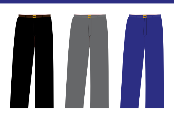
SKIRT, PINAFORE DRESS OR TROUSERS Navy blue, grey or black skirt & trousers