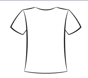
PLAIN WHITE TSHIRT School logo available from Skoolkit but not compulsory