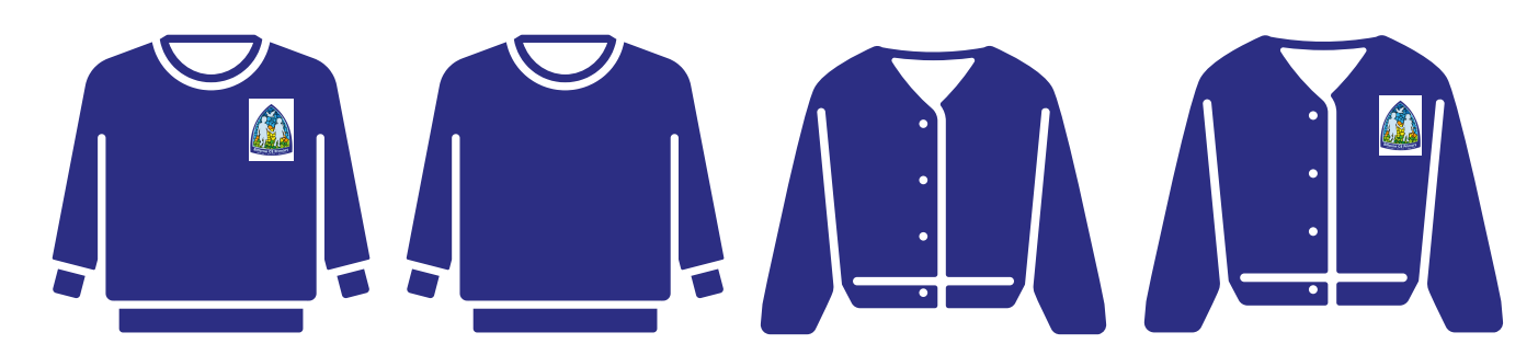
CARDIGAN OR SWEATSHIRT

Plain Navy sweatshirt or cardigan or school logo available from Skoolkit but not compulsory